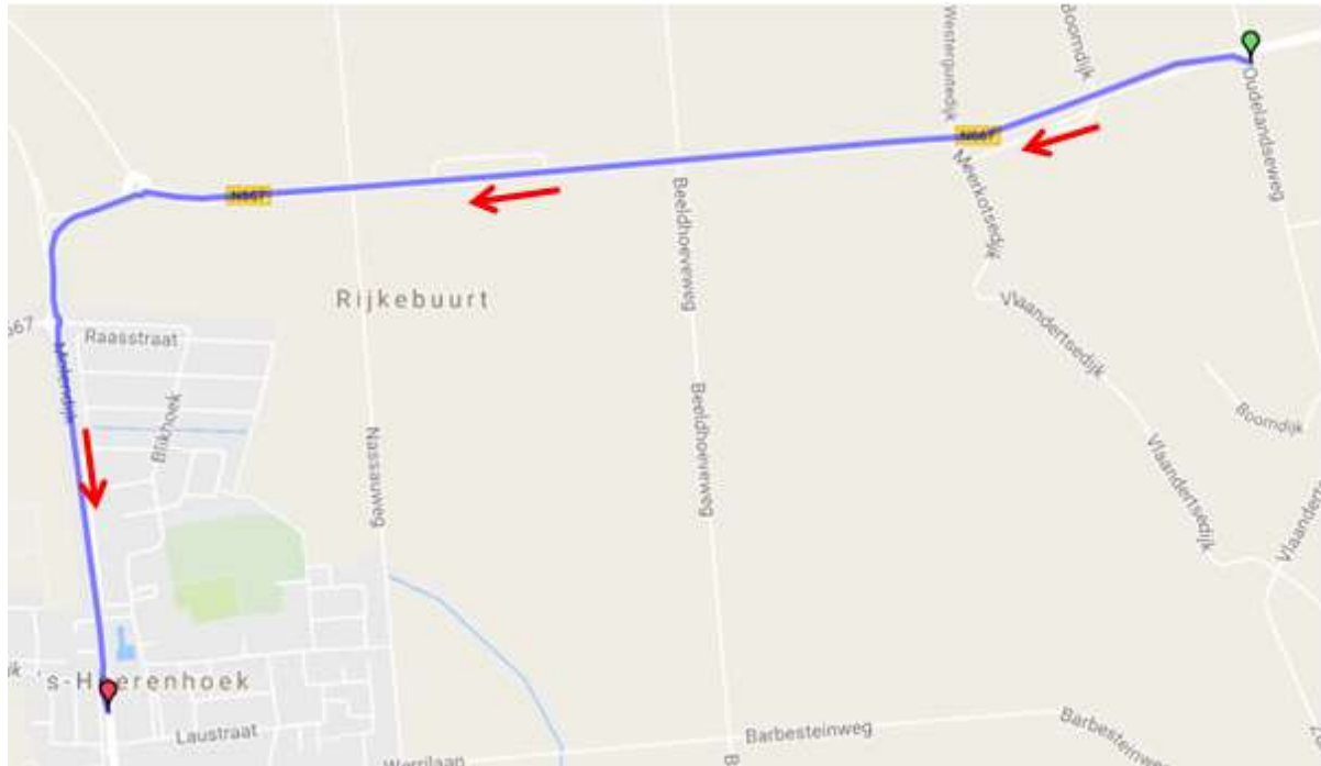
Stage Profile last 3 km